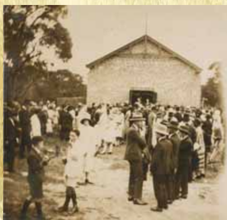
Old (West) Bullsbrook Hall about 1925.