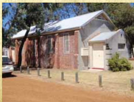
West Bullsbrook Hall 2011.