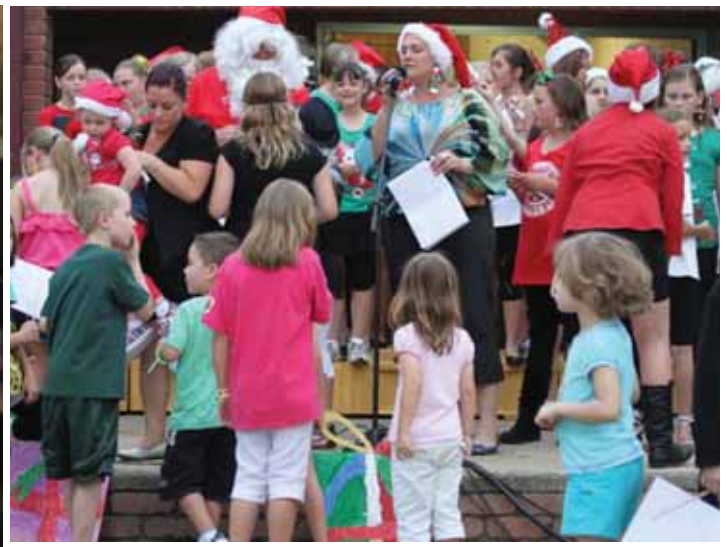
No carols would be complete without a visit from Santa