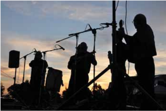
The band "Huaira"(pronounced, why-ra) performing as the sun sets