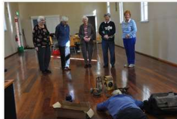
Setting up for a publicity shot.