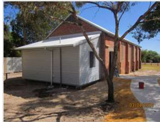
New kitchen and storeroom for the Hall completed by the City of Swan in April 2014 to replace the old kitchen