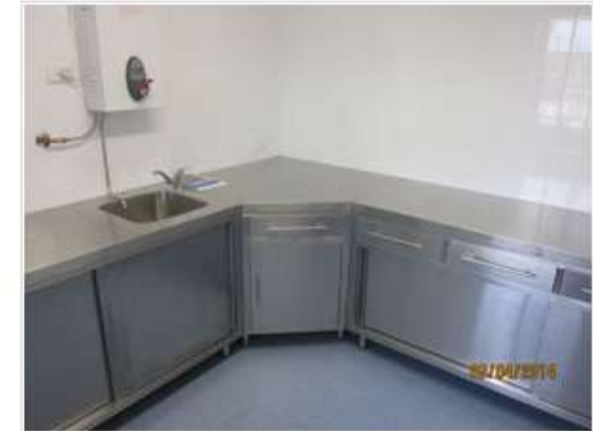
Inside the new kitchen at the Museum.