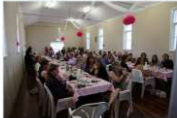
High Tea in the Hall. September 8 2013.